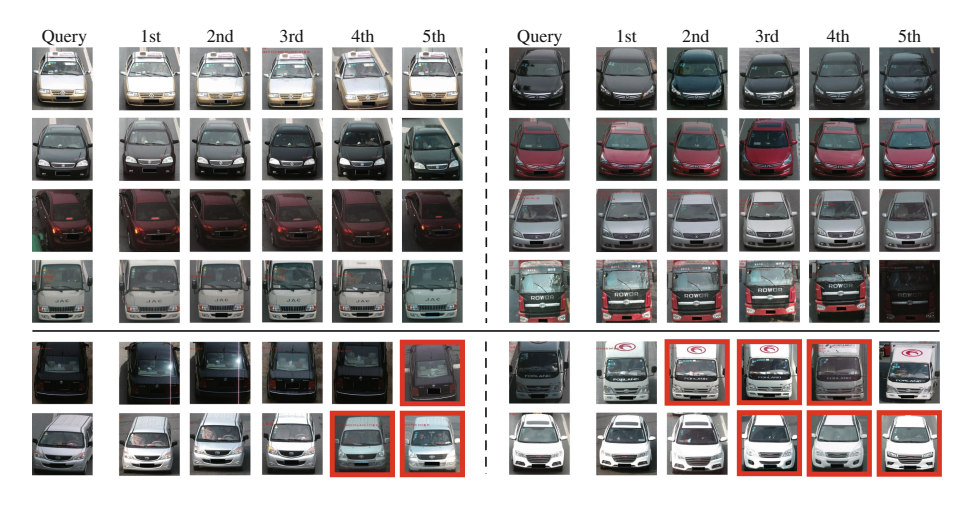
Fig. 4. The top-5 re-identification results on the large-scale VehicleID dataset. The upper eight examples are successful, while the lower four examples are failure cases. Red boxes denote false positives. (Best viewed in color and zoomed in.) (Color figure online)

From the qualitative perspective, Fig. 3 shows the learned attention maps (i.e., a_{(i,j)}) in Eq. 7) of several random sampled test vehicle images. We can find that the attended regions accurately correspond to these subtle and discriminative image regions, such as windshield stickers, stuffs placed behind windshield or rear windshield, and customized paintings. In addition, Fig. 4 presents several re-identification results returned by our RNN-HA on VehicleID.