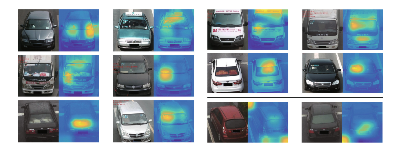
Fig. 3. Examples of the attention maps on VehicleID . The brighter the region, the higher the attention scores. (Best viewed in color and zoomed in.)